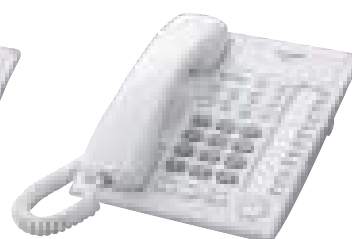
■ KX-T7750 Monitor Unit