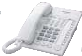
■ KX-T7720 Speakerphone Unit