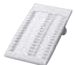
■ KX-T7740 DSS Console