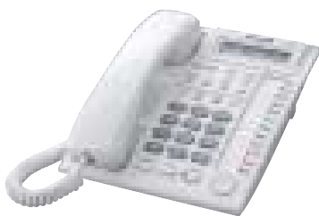
■ KX-T7730 LCD, Speakerphone Unit

* An optional card is required. Please contact your dealer or phone company to confirm if the Caller ID service is available in your area.